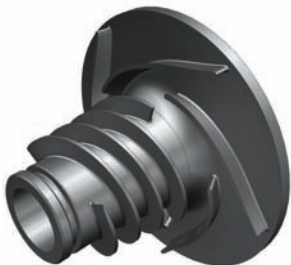
Multi-stage inducer example.