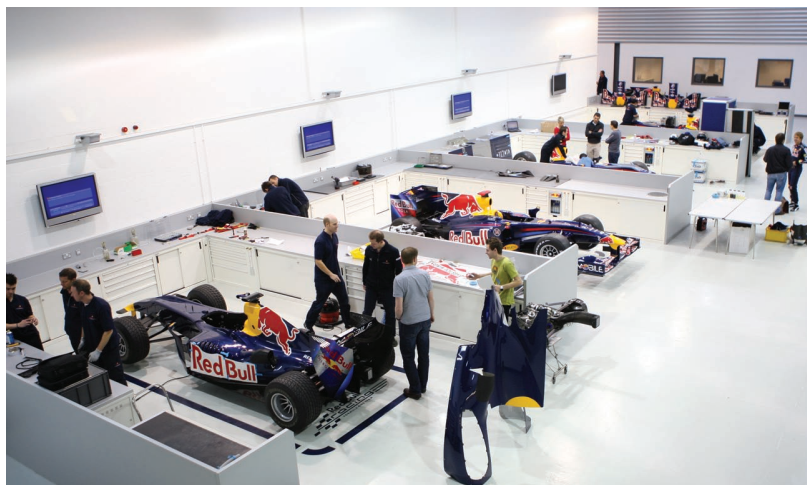
Race bays at Milton Keynes Factory, where everything comes together.

In addition to planned adjustments, the design team of 180 NX users is on the alert to make performance-enhancing modifications after every race. There is a continual fine-tuning of the design and any amendments have to be driven from the discussion stage through implementation, testing and manufacturing in the space between races. Sometimes this can be as little as one week and parts are often carried to the circuit within hours of the starting lights going out. There is no room for error or delay. “NX allows our 180 designers to operate in a virtual world, shaving time off at every step,” says Nevey. “NX is an excellent NC programming tool and members of Siemens’ professional services team have been brilliant at helping us to get the most out of our tools. They have, for example, demonstrated