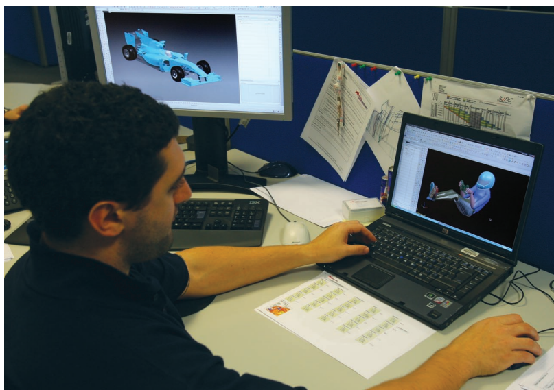
Design engineer at work.