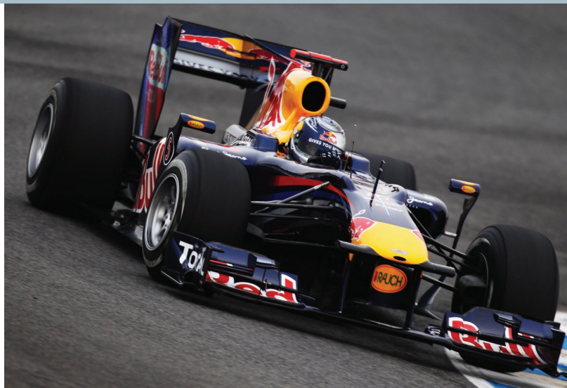
Testing the RB6.

Design of the car begins with the overall aerodynamic package and what is referred to as the chassis: the carbon fiber survival cell in which the driver sits. The engine is bolted to the back of the cell and the gearbox attached behind the engine. Systems such as hydraulics and suspension need to fit in and around these components, with the radiators being positioned on either side of the driver.