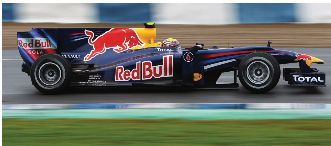
Testing Day – RB6 February 2010.